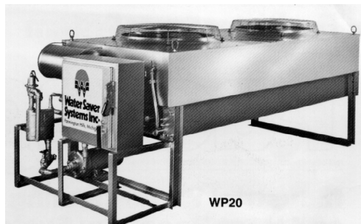
A typical closed-loop water system.

By using a properly installed, maintained and sized water system you can prolong the life of your electrical equipment and be kind to our environment at the same time.